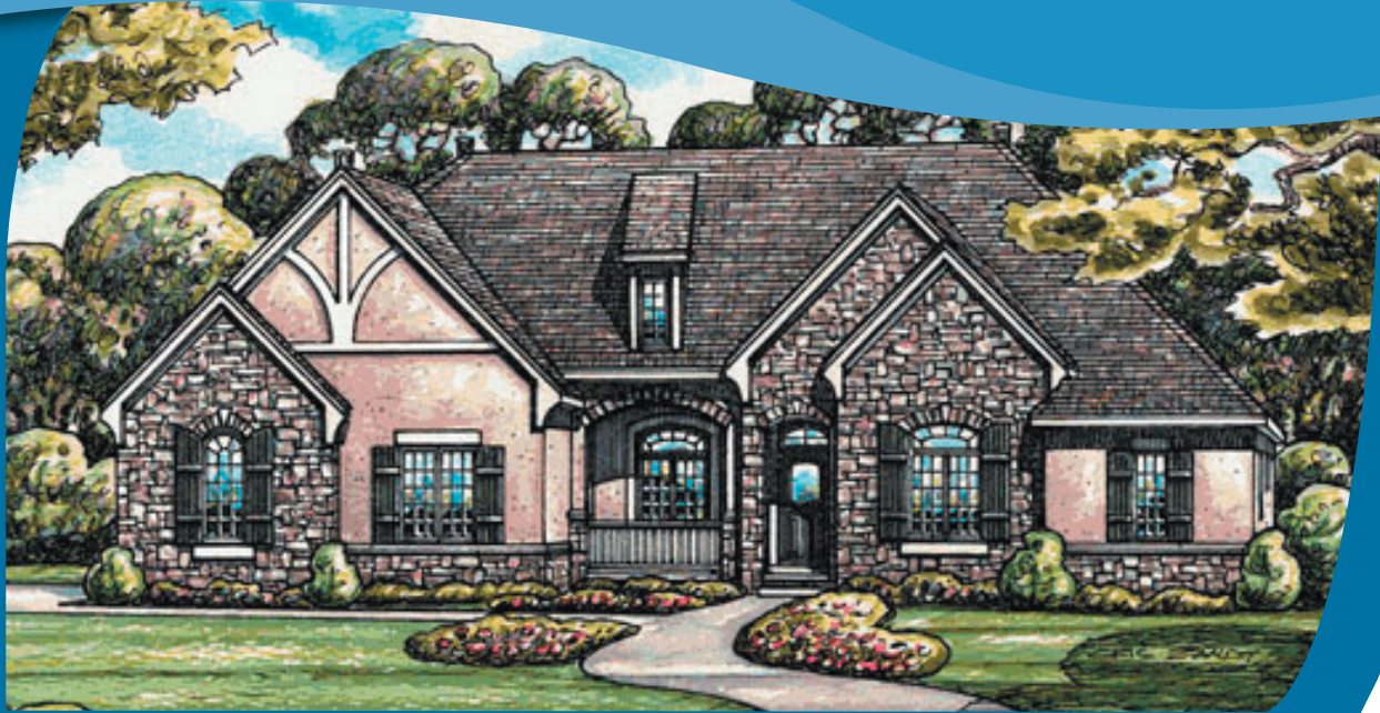
The McAllister • 2598 sq. ft. 68' wide • 65' deep