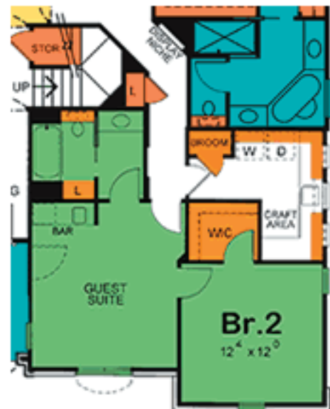
Optional Guest Suite