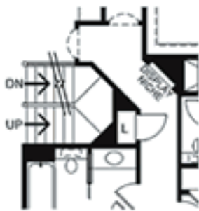
Optional Basement Stair Location