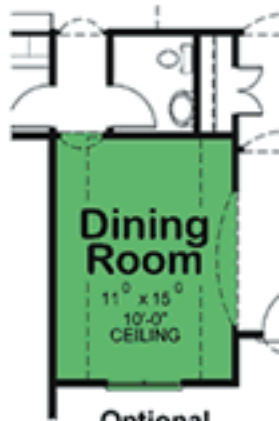
Optional Dining Room