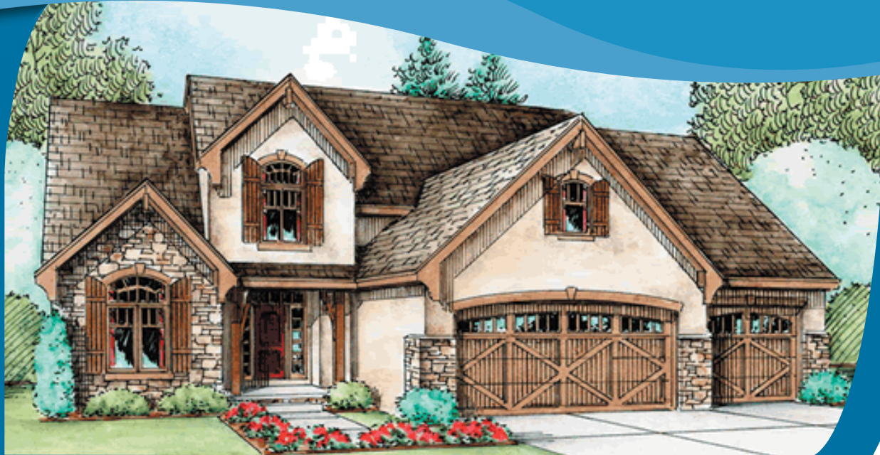
The Palmer • 2422 sq. ft. • 59' wide • 58' deep